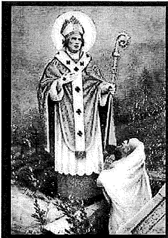
Saint Stanislaus, Bishop and Martyr April 11th

➤ Defiance Co Dream Center looking for volunteers. The mission of the Dream Center is to reach people with the love of Christ by meeting both physical and spiritual needs. The Defiance Dream Center has been working quite extensively on the east side of Defiance neighborhood and will soon launch a second adopted block on the north side of Defiance. They will also consider requests for assistance from other areas of the Defiance as well. Some of the needs they have identified are: mentorship/life coaching; transportation; addiction recovery; and workforce preparation and others.