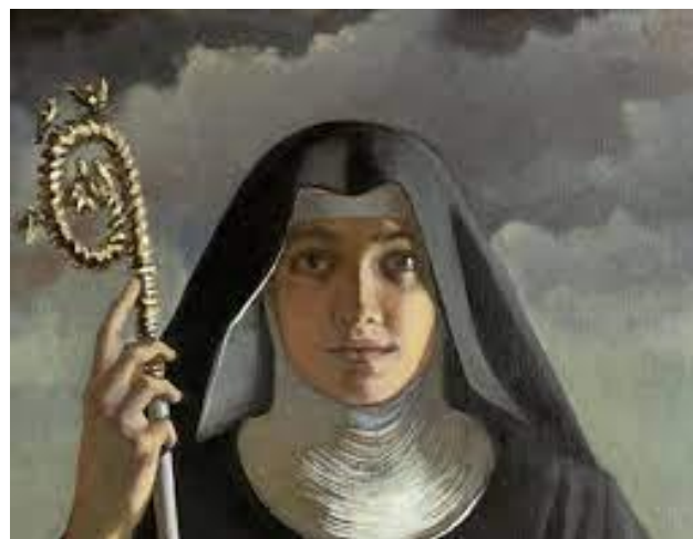
Memorial of Saint Scholastica, Virgin February 10 th

-For help with an unexpected pregnancy, for help for mothers & babies in need, for healing from abortion, Call 1-800-633-3339