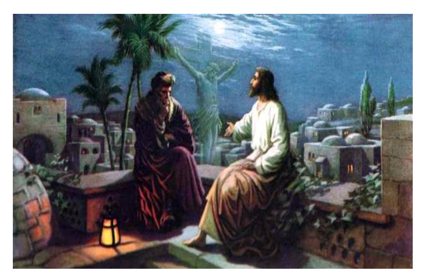
Sixth Sunday of Easter May 14, 2023